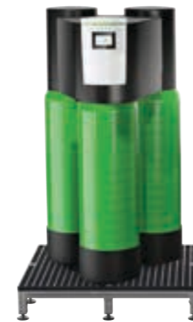
Water softener softliQ:LB120i on pedestal