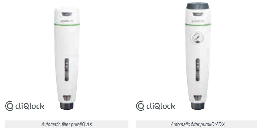
cliQlock Automatic filter pureliQ:AX

Accessories: For drain connection DN 50 (order no. 188 875), please refer to page 41 and for adapter kits to page 18 of our General Catalogue for Residential Applications.