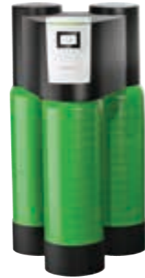
Water softener softliQ:LB120