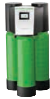
Water softener softliQ:LB70