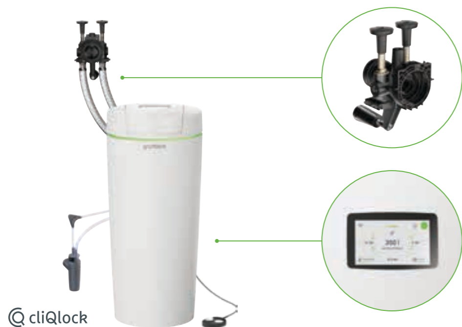
Water softener softliQ:SE