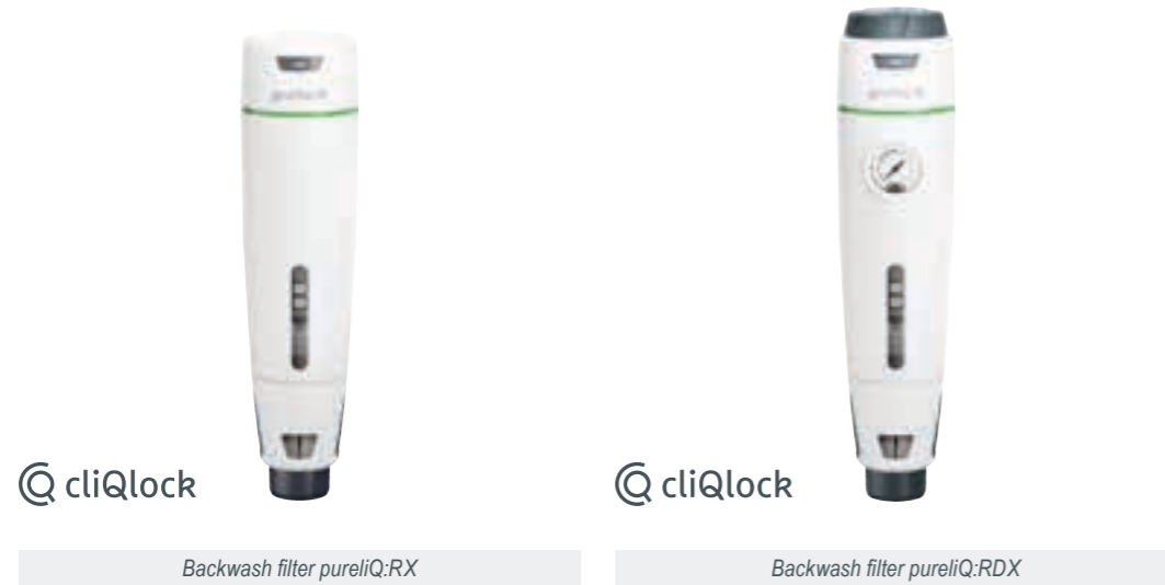
cliQlock Backwash filter pureliQ:RX