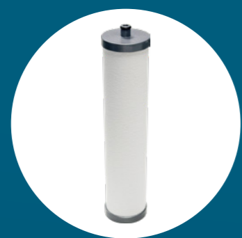
PFAS absorber cartridge